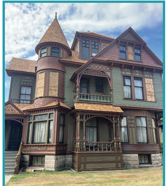
Windows are removed from the Hume House and taken to Grand Rapids for restoration.

Stay tuned for future updates as this exciting restoration progresses!