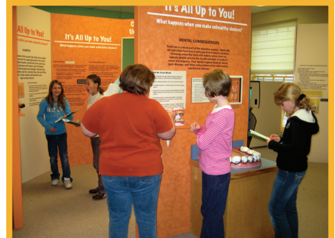
Body Works exhibit