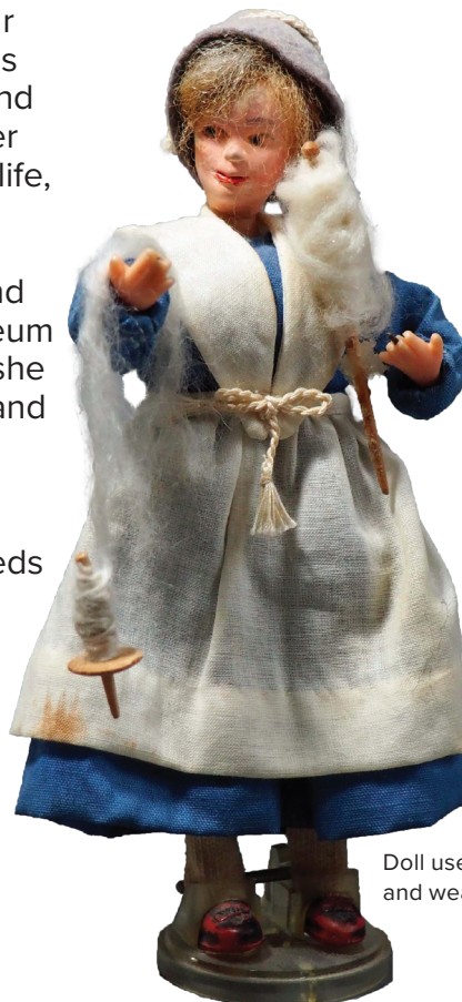
Doll used by Florence to teach spinning and weaving at the museum.