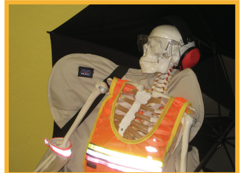
Mr. Bones enjoying his retirement.

The first exhibition in the new gallery is Mosaic Muskegon . It is a photographic exploration of Muskegon County's landscapes, buildings, and landmarks. William Hansen captured more than 56,000 individual images to create over 2,650 highly detailed mosaic photographs of sites across Muskegon County. Hansen donated the digital images to the Archive & Collection, where they will document and preserve this moment in Muskegon County's visual history.