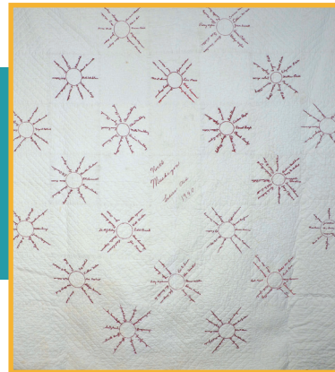
Fundraiser quilt made by the North Muskegon Ladies Aid Society. People could donate money to have their names embroidered on the quilt. To see the list of names, visit the museum's online collection database.