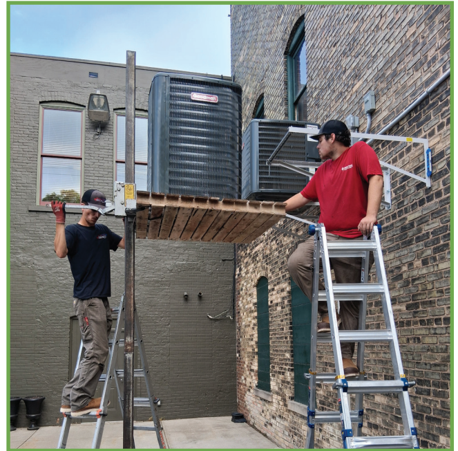
A crew from McKellips & Sons Heating & Cooling lifting the final AC condenser into place.