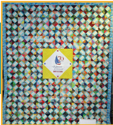
Quilt made by members of the Women's Division Chamber of Commerce for their 70th anniversary. As a fundraiser, people purchased raffle tickets to win the quilt. The quilt winner donated the quilt to the museum.

To all who support us: thank you . We truly could not do this work without you. Your passion, partnership, and pride fuel everything we do.