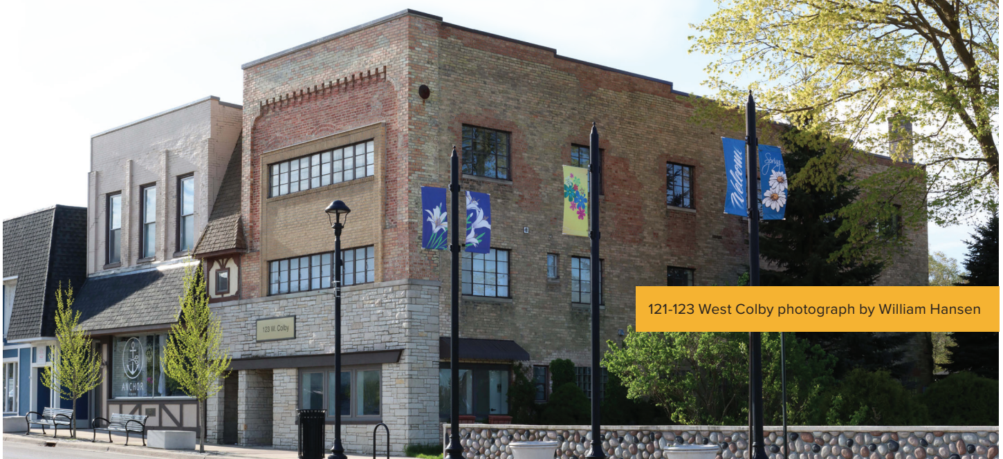
121-123 West Colby

We are grateful for William Hansen capturing more than 56,000 individual images to create over 2,650 highly detailed mosaic photographs of sites across Muskegon County.