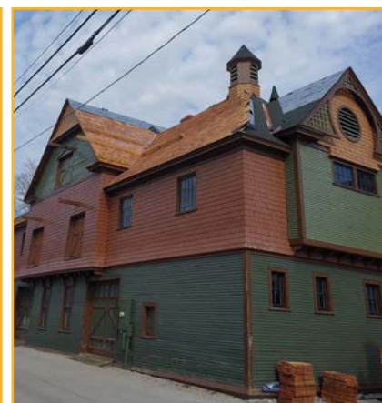
The City Barn roof under construction