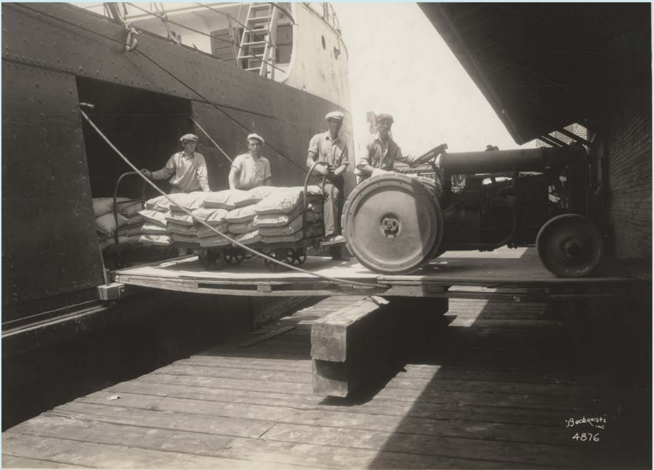
Unloading of a ship at the Mart Dock, ca. 1933-1950, one of the stops on the World War II Walking Tour.