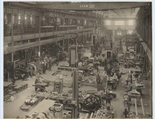
Morton Manufacturing Company, circa 1910s