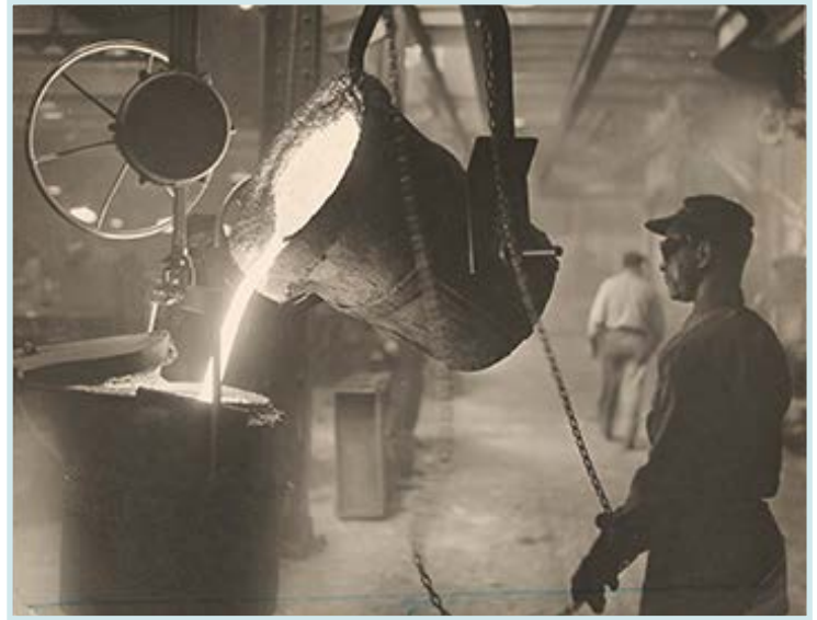
An employee of Campbell, Wyant & Cannon pours a crucible, ca. 1942-1945.