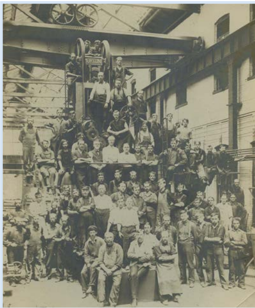
Employees of the Morton Manufacturing Company, date unknown