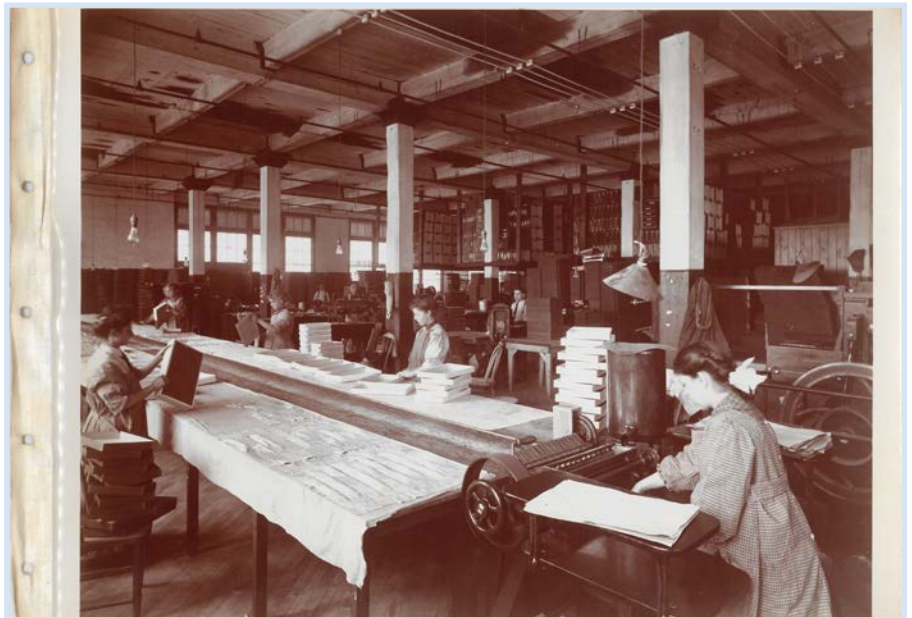
Employees of the Amazon Knitting Box Department, 1907