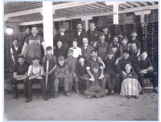
Amazon Knitting Company, date unknown