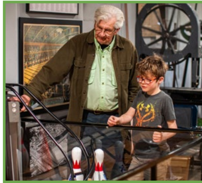
Guests enjoying the Muskegon Heritage Museum of Business & Industry in 2024.