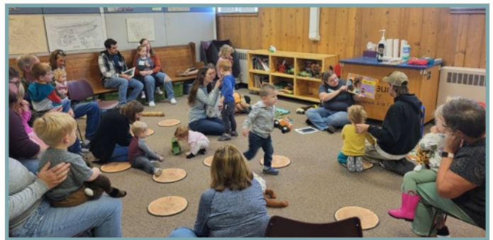
Students in the current classroom space

The challenges and benefits of a museum expansion and new building are even greater. To begin with, an expansion would mean lots of construction and parts of the current building being shut down.