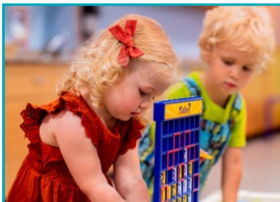
Current exhibit spaces at the Muskegon Museum of History & Science

The current rotating gallery greatly restricts what traveling exhibitions are available to us. We are limited in what large-scale objects from the museum's Collection we can display because of the size of the entrances, elevators, and the lack of a loading area. A larger rotating gallery with appropriate access would address many of these issues.