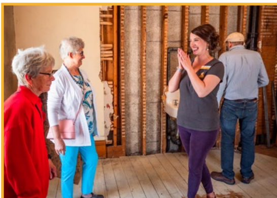
Guests enjoying their visit at the Hackley & Hume Historic Site this summer.

Holiday Tours (seasonal): Experience the Hackley & Hume Houses adorned for the holidays.