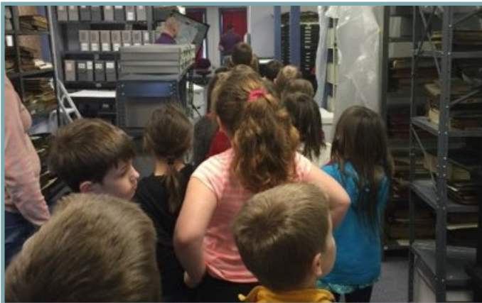
Students visiting the Museum’s Archives

The first benefit is having the museum’s collection housed in an attached building. Currently, some students can access the museum’s archives for special tours, but there is no space to teach or host lessons.