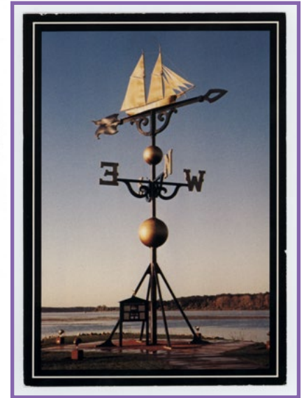
World's Largest Weathervane in Montague

Did you know? All proceeds from your purchases at our gift stores support the Lakeshore Museum Center's sites and mission. Lakeshore Museum Center members receive a 10% off discount in all merchandise sales at our gift stores.