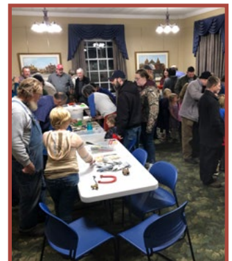
Events and programs in our current auditorium space.