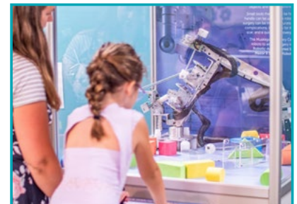
Current exhibit spaces at the Muskegon Museum of History & Science

Another challenge of residing in an older building is retrofitting it to improve physical accessibility. Through the expansion, we aim to improve the physical