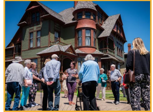
Guests enjoying their visit at the Hackley & Hume Historic Site this summer.

At the Muskegon Historic Sites, we've already seen this growing demand firsthand. Visitor numbers have increased significantly in recent years, particularly in the group and leisure travel markets. In response, we launched Tours by Appointment, a flexible program that invites guests to immerse themselves in Muskegon's history through customized guided tours. Visitors may choose to explore the beautifully preserved Hackley & Hume Houses and City Barn, the Fire Barn Museum, and the Scolnik House of the Depression Era. Tours by Appointment includes classic tour packages as well as themed and specialty experiences, such as: