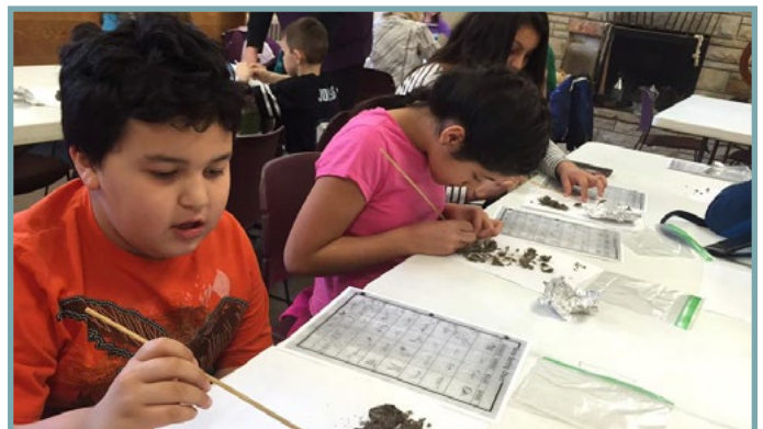
Students in the current classroom space

Thankfully, we have already planned how we can maintain as much of a normal experience as possible while in the transition phase. Although an expansion and move of collections would cause disruptions, the benefits would far outweigh these once we settled into a new building and the possibilities already have the programming staff planning for the future.