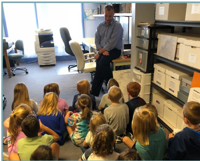
Students visiting the Museum’s Archives

The museum’s collections center is currently inaccessible to school groups because it is 1.5 miles from the museum. A new collections space in a combined facility would solve these issues and let us connect more learners directly to the museum collections and resources.