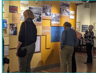
Current exhibit spaces at the Muskegon Museum of History & Science

We could create more immersive and interactive opportunities throughout all the exhibitions.