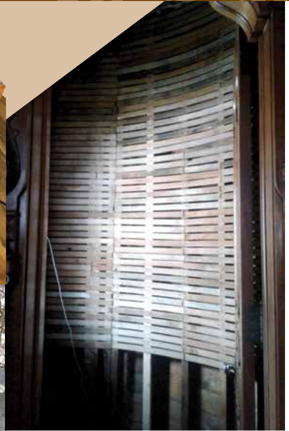
Prior to applying the actual plaster, the walls are prepped and repaired.