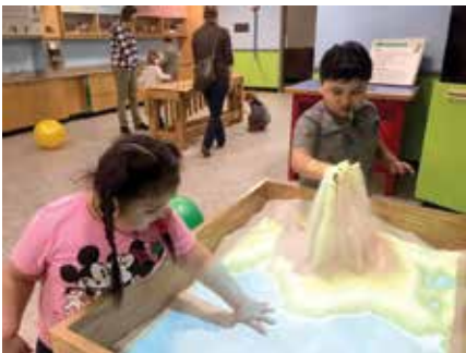
Our augmented reality sandbox

There is something for everyone here at the Museum: temporary exhibits with interactive activities like The Show Must Go On , galleries of science and history, plus the hands-on Science Center and Body Works exhibits. There truly is something for all ages and interests. For some families with Autism Spectrum Disorder (ASD) or other sensory needs, the Museum's many activities and exhibits can be a little overwhelming, especially when the Museum is packed with many people. It was important for us to create a welcoming, friendly, and fun space where these families could have the opportunity to come experience the Museum.