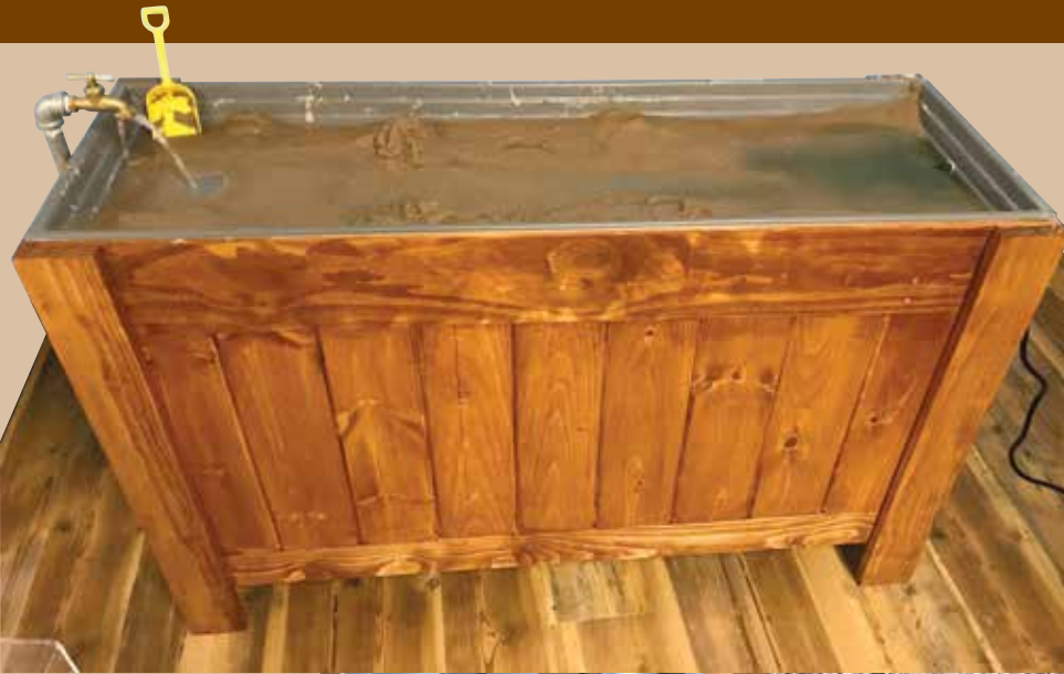
The sand table base prior to installation.