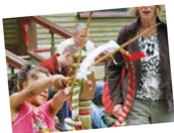
Enjoy learning historical games on the lawn.